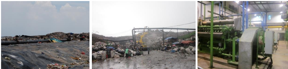
Landfill gas power plant-Bantar Gebang

The application of waste management in Indonesia mostly involves the use of landfills. Almost all of the landfills were originally designed as controlled landfills and sanitary landfills. In fact, all of them were operated as open dumping system. This can be concluded as there is no treatment carried out on incoming waste, inadequate leachate treatment and landfill gas emissions released to the atmosphere without any treatment. The Bantar Gebang Landfill, is a landfill that holds almost waste from Jakarta with one of business plant developed that is capturing methane gas and converting into electricity, which is in operation to generate about 10 MW electricity and expecting to generate 25 MW power by 2023.