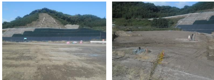
Seibu (Nakata) Landfill site Fukuoka

The fundamental difference in the use of landfills in Indonesia and Japan is related with the methane generated. In order to reduce the methane generated, Semi-aerobic landfill system (Fukuoka method) is developed by Fukuoka City. Fukuoka method offer some advantages include: purification of leachate, accelerating the landfill stabilization, reduction of methane production, resolving the odor problem, and saving the construction and operation cost.